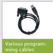
Various programming cables