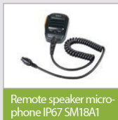
Remote speaker microphone IP67 SM18A1